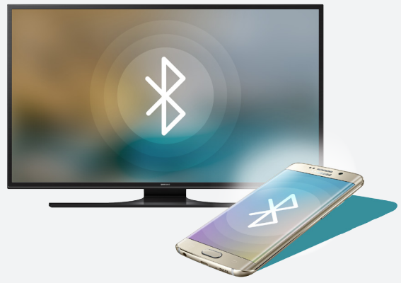
Figure 5. Bluetooth Music Player (Mobile to TV)

Bluetooth Music Player, which is included in HD690, provides a cozy, home-like atmosphere by enabling guests to listen to their mobile device audio through an easy connection The Bluetooth Music Player feature eliminates the need for hotels to purchase additional costly audio docking stations that can easily be broken or stolen.