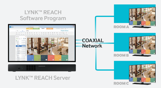
\textit{Figure 3. LYNK REACH offers a flexible and low-cost coaxial infrastructure \textit{Hospitality TV} \textit{ solution} \\

Designed exclusively for hospitality businesses to help them manage content and control displays over current RF cables, LYNK<sup>TM</sup> REACH delivers remote, central and cost-efficient management of in-room displays. LYNK REACH is specialized software provided with LYNK REACH Server for hospitality environments. The software solution provides a simplified UI and editing tool that organizes and displays content, such as hotel information, images and logos, using existing infrastructures. LYNK REACH offers hoteliers advanced advertising functionalities and Channel Bank Management for Pay TV Services. In addition, LYNK REACH improves usability by enabling hotel managers to monitor room status, recent deployment and activity and with a simple, easy and intuitive user interface (UI) through Project Creator.