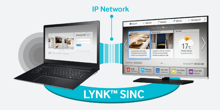
Figure 2. LYNK SINC offers interactive solution for IP hotel infrastructure

The guest experience is enhanced with access to services and