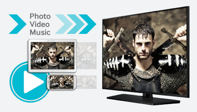
Figure 6. Wireless connectivity enables wide variety of content sharing

Soft AP provides a software access point (AP) or hotspot. Up to four devices can connect wirelessly to the AP. Hotel managers can change the signal level and channel of the Soft AP to suit the connectivity environment of different rooms.