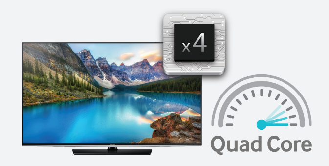
Figure 7. Quad Core processor enables smoother and faster TV performance

With a Quad Core processor, guests can experience smoother navigation and faster access to smart features for enhanced TV viewing and operation. With Instant On, the TV boots in only 2 seconds to reduce waiting time.