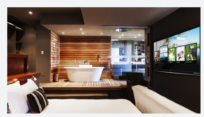
Figure 1. Samsung SMART hospitality displays upscale hotel suite atmosphere

Samsung SMART Hospitality Displays are integrated, high-performing TVs that include many desirable features and an interface designed for ease of use. The displays create a stylish room ambiance and provide a superior viewing experience in a streamlined design. They deliver myriad entertainment options for guests through smart connectivity features. To enhance the hotel's brand, staff members can customize welcome menus with a straightforward interface. Additionally, hotels can stay on budget with affordable content-streaming options and other cost-saving features.